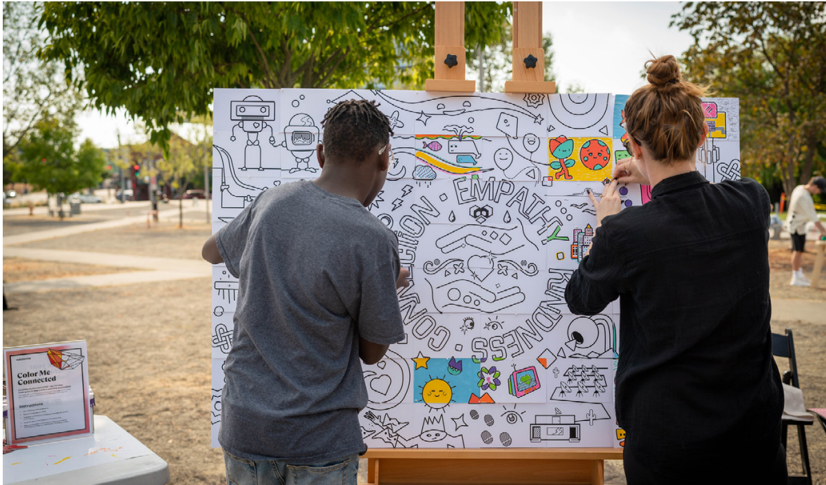
Color Me Connected by Substantial A paint-by-number pop-up experience created to foster human connections through creativity, fun, and self-expression. A canvas is present where paint-by-number pieces are decorated before being placed on the canvas.