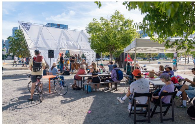
Musical performance by 13 Rabbit