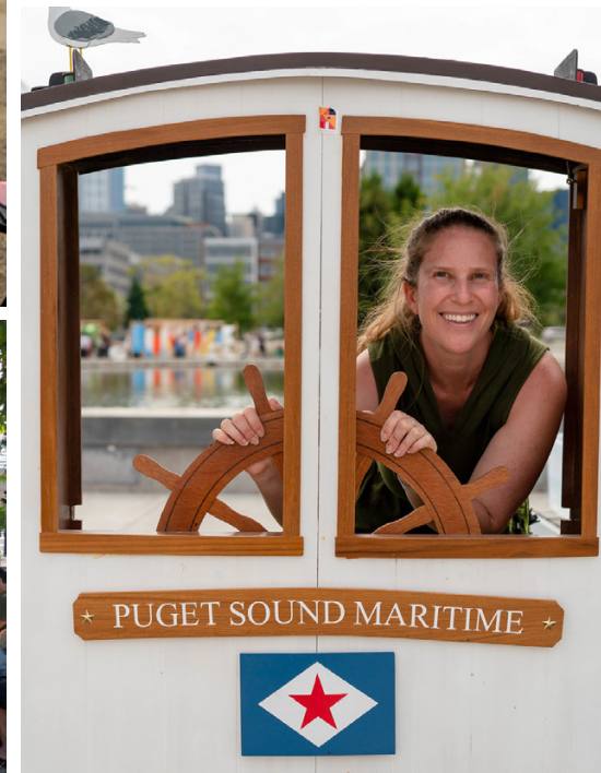
Sink or Sail: Toy Boat Challenge by Puget Sound Maritime A paper boat-making exercise complete with a test sail in the model boat pond.